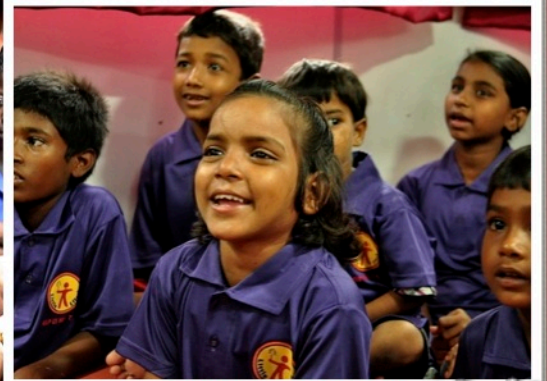
KEYS OF CHANGE IN KOLKATA AUGUST 2013

KEYS OF CHANGE IN SIERRA LEONE FEBRUARY 2013