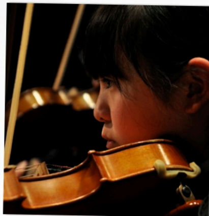
JOURNEY OF HOPE